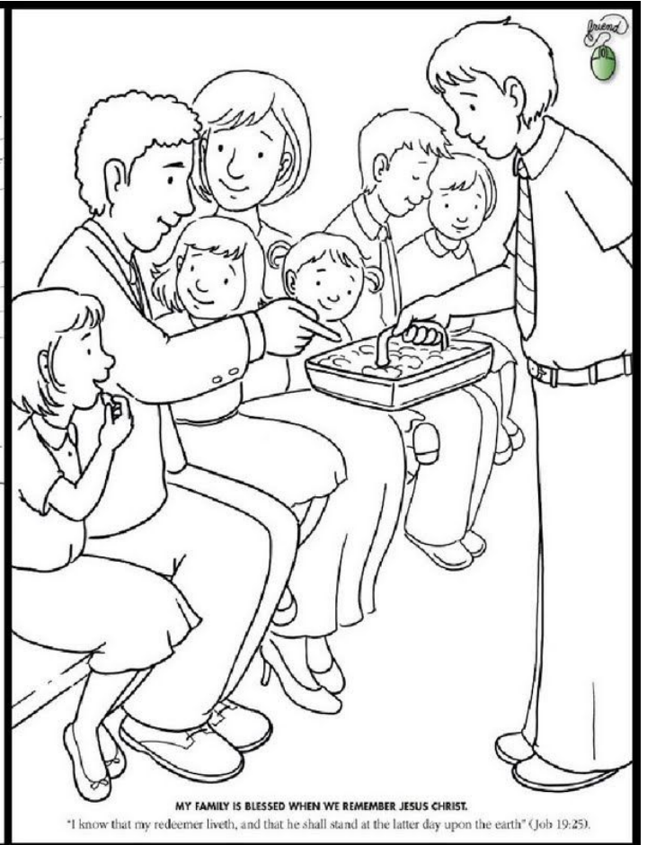
MY FAMILY IS BLESSED WHEN WE REMEMBER JESUS CHRIST. "I know that my redeemer liveth, and that he shall stand at the latter day upon the earth" (Job 19:25).