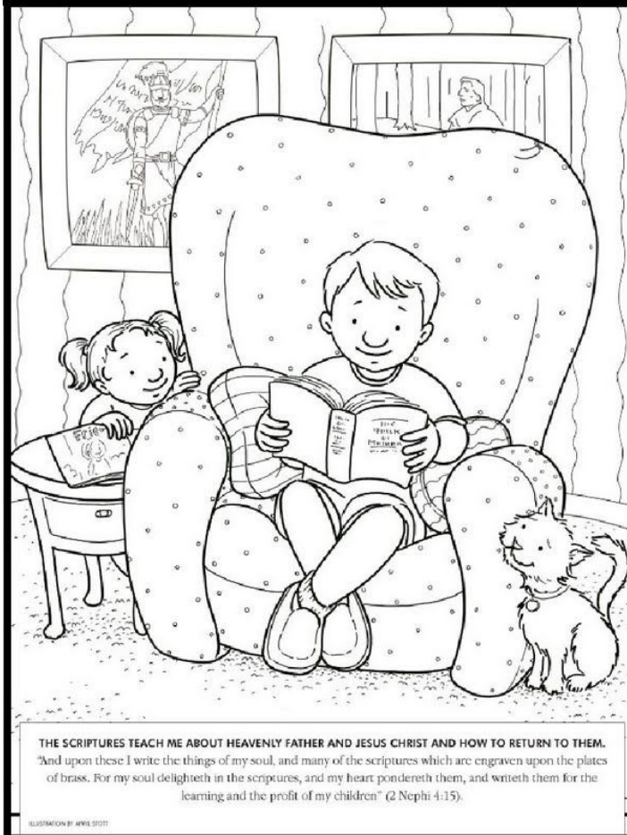
THE SCRIPTURES TEACH ME ABOUT HEAVENLY FATHER AND JESUS CHRIST AND HOW TO RETURN TO THEM. "And upon these I write the things of my soul, and many of the scriptures which are engraven upon the plates of brass. For my soul delighteth in the scriptures, and my heart pondereth them, and writeth them for the learning and the profit of my children" (2 Nephi 4:15).