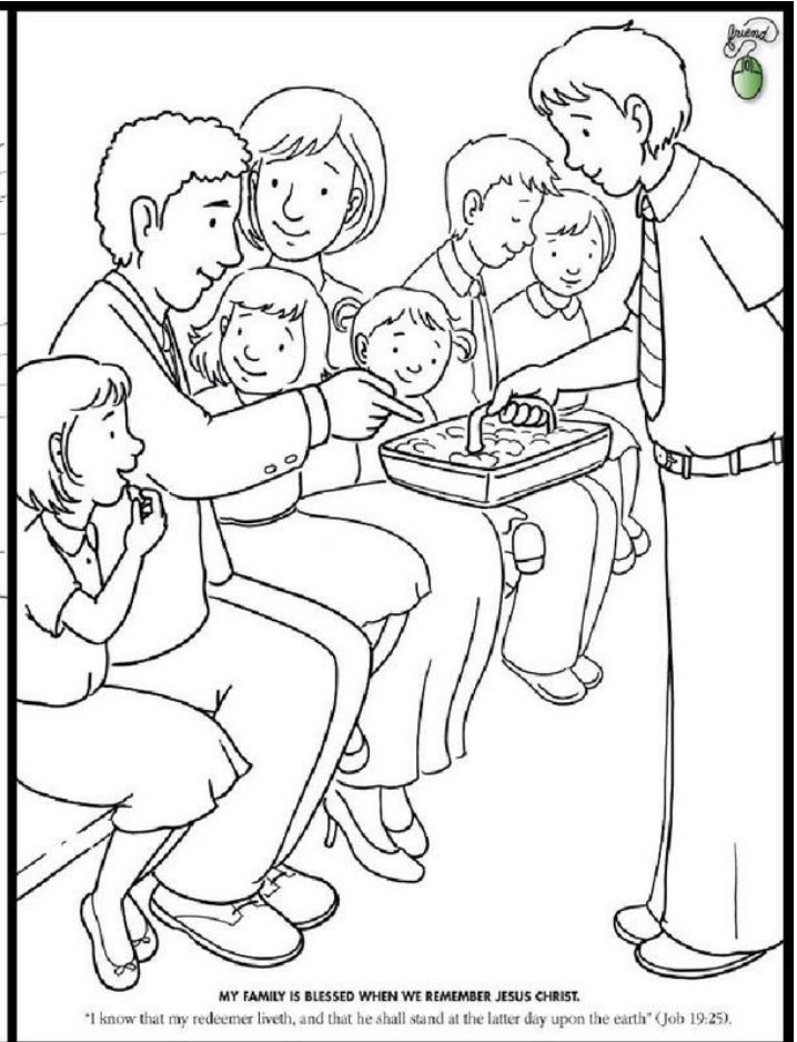
MY FAMILY IS BLESSED WHEN WE REMEMBER JESUS CHRIST. "I know that my redeemer liveth, and that he shall stand at the latter day upon the earth" (Job 19:25).