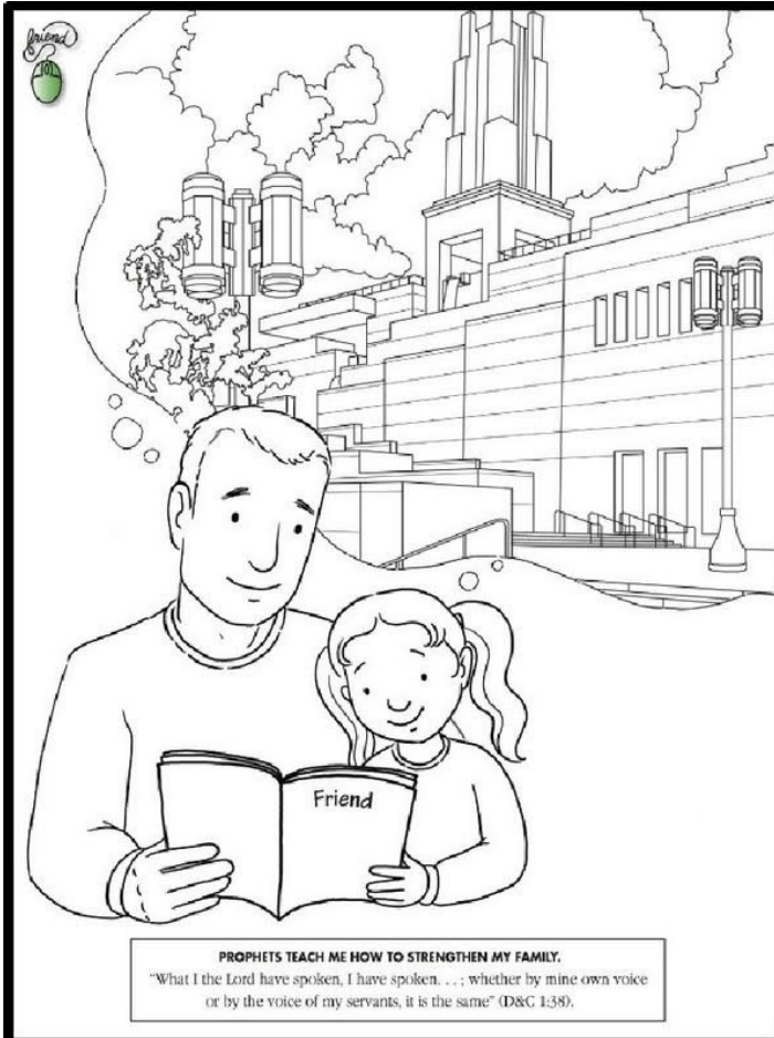
PROPHETS TEACH ME HOW TO STRENGTHEN MY FAMILY. "What I the Lord have spoken, I have spoken. . . : whither by mine own voice or by the voice of my servants, it is the same" (D&C 1:38).