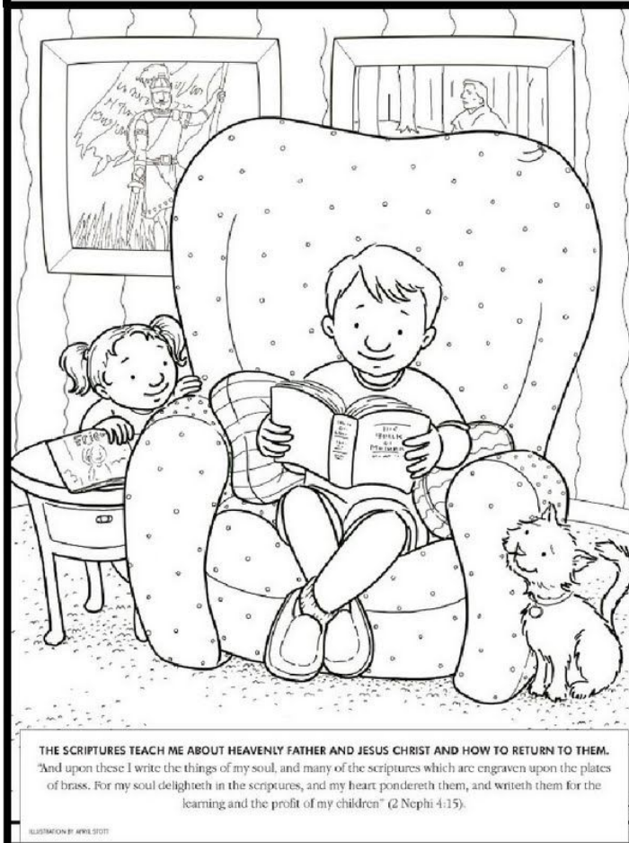
THE SCRIPTURES TEACH ME ABOUT HEAVENLY FATHER AND JESUS CHRIST AND HOW TO RETURN TO THEM. "And upon these I write the things of my soul, and many of the scriptures which are engraven upon the plates of brass. For my soul delighteth in the scriptures, and my heart pondereth them, and writeth them for the learning and the profit of my children" (2 Nephi 4:15).