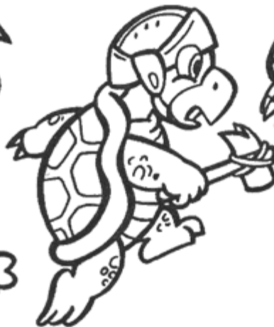
THE HAMMER BROS.