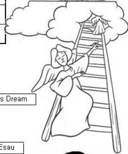
Jacob and Esau