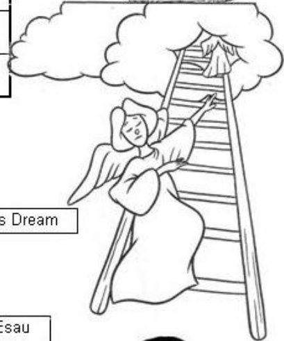
Jacob and Esau