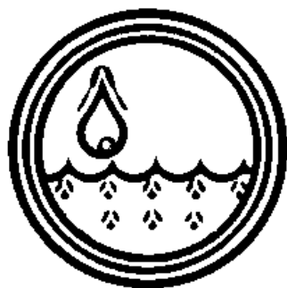
Waters Turn to Blood Exodus 7:14-25