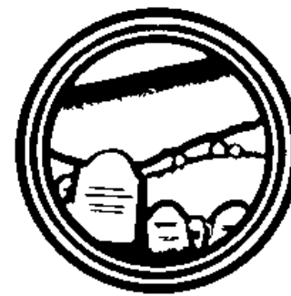
Death of First-Born Exodus 11:1-12:36

Copyright Lexipol, Bible Software 2008 Artwork by Aaron Schoedel