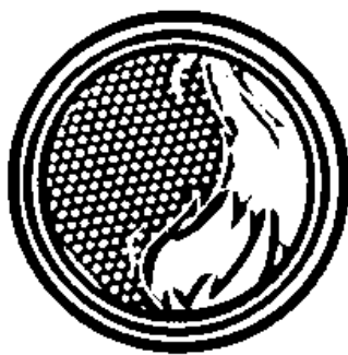
Hail and Fire Exodus 9:13-35