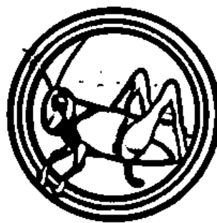
Locusts Exodus 10:1-20