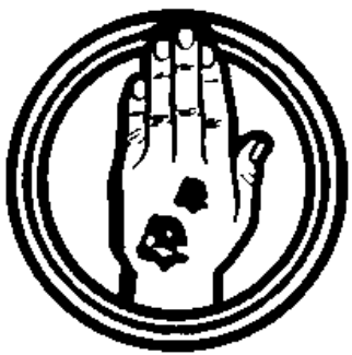
Unhealable Boils Exodus 9:8-12