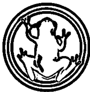
Amphibians (Frogs) Exodus 7:26-8:11