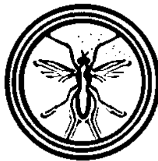
Gnats (Lice) Exodus 8:12-15