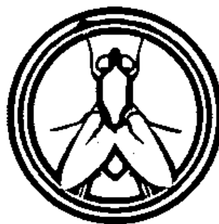
Flies Exodus 8:16-28