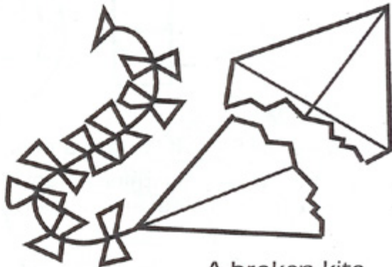
A broken kite