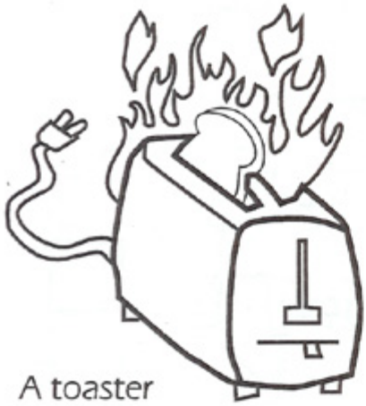
A toaster on fire