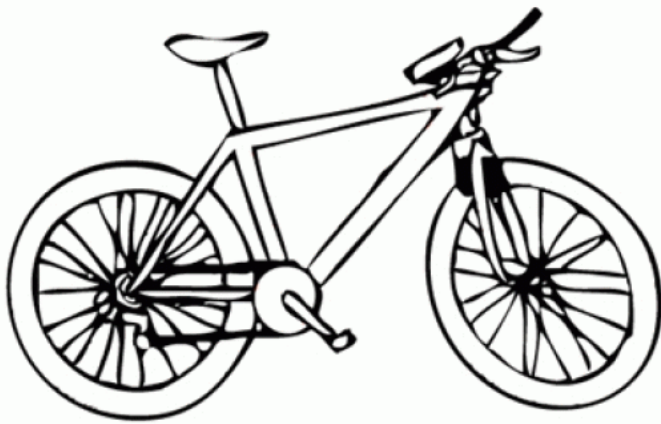
A green bicycle