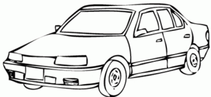
A yellow car