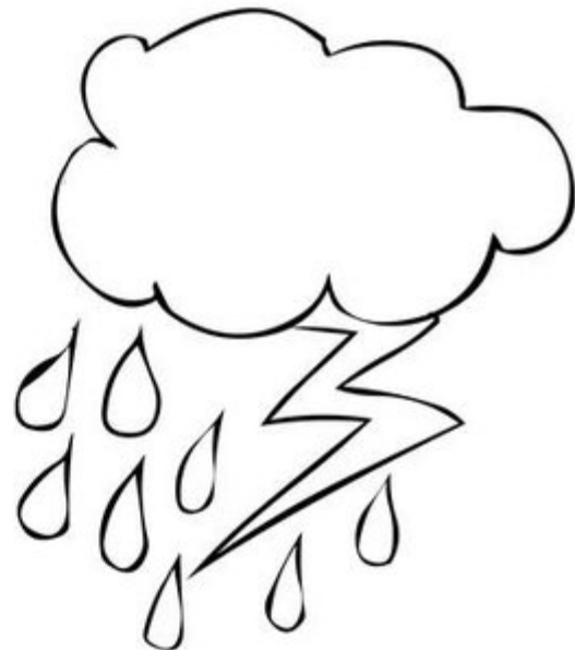
Water can be a liquid.