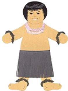
Sample Flat Stanley (from Hawaii)