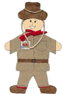
Sample Flat Stanley (from Australia)