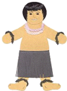
Sample Flat Stanley (from Hawaii)