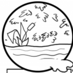
WATER TURNS TO BLOOD