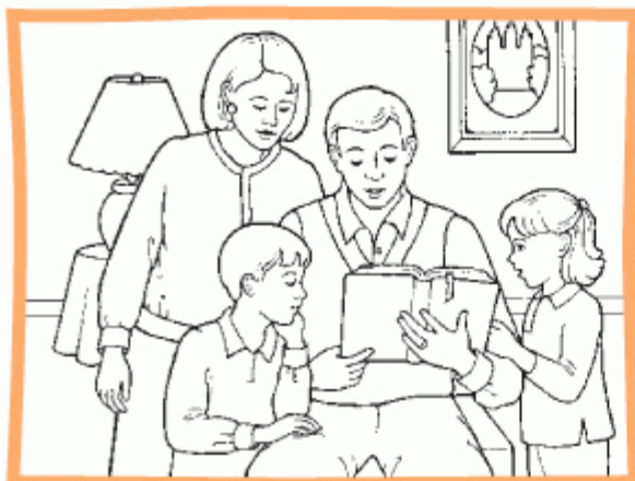
3. Heavenly Father asked special people to help me and guide me.