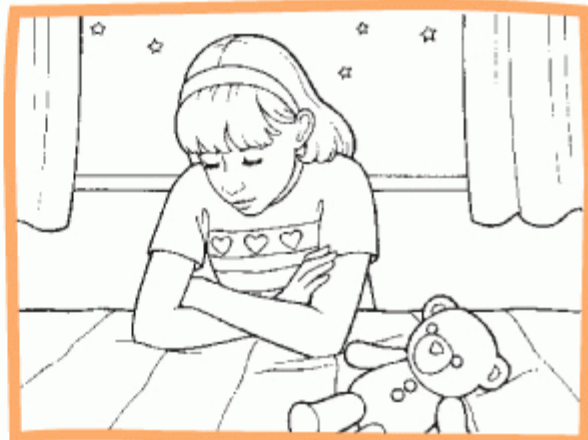
4. I can talk to Heavenly Father in prayer, and He will answer me.