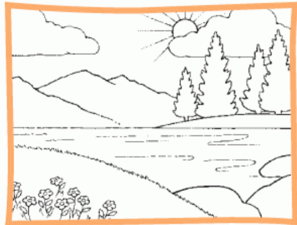
2. A beautiful world was created for me.