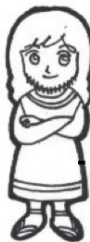
James (Son of Alphaeus)