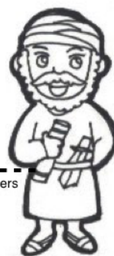
Judas (Jude, Thaddaeus, Lebbaeus)