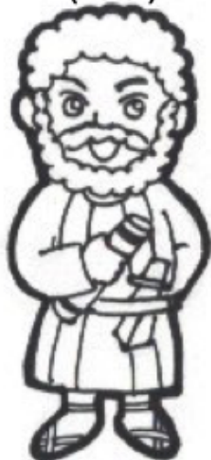
Simon (The Zealot)