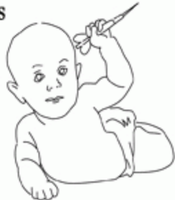
professional darts hustler