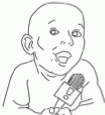
dishy celebrity news correspondent