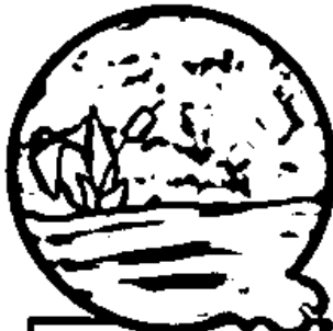
WATER TURNS TO BLOOD