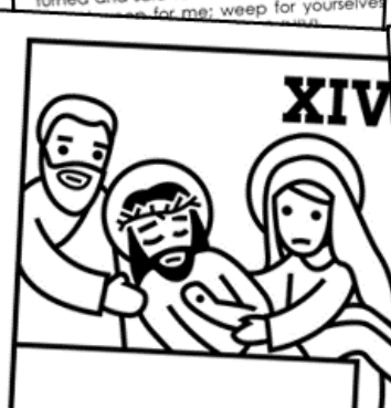
JESUS IS LAID IN THE TOMB

37 Now when evening had come, there came a rich man from Arimathea, named Joseph, who himself had become a disciple of Jesus. 38 This man went to Pilate and asked for the body of Jesus. Then Pilate commanded the body to be given to him. - Matthew 27:57