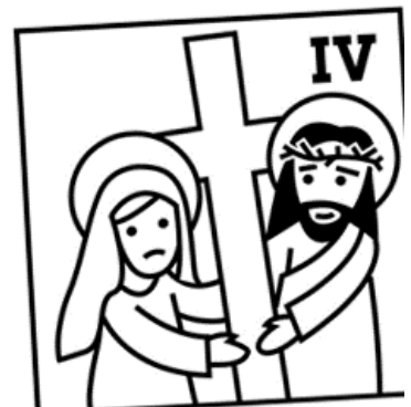
JESUS MEETS HIS MOTHER, MARY

17 Carrying his own cross, he went out to the place of the Skull (which in Aramaic is called Golgotha).