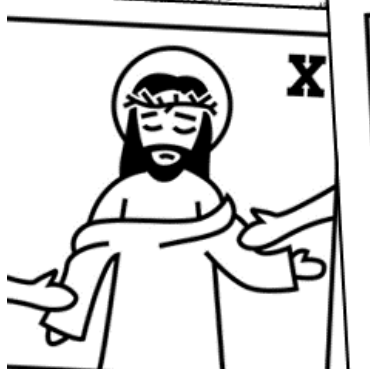
JESUS IS STRIPPED OF HIS CLOTHES

Jesus said, "Father, forgive them, for they do not know what they are doing."