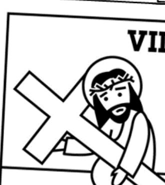
JESUS FALLS FOR THE SECOND TIME

"A new command I give you: Love one another. As I have loved you, so you must love one another. This is the love that everyone will know that I have come from the Father and have sent the Holy Spirit into the world." - John 13:34-35