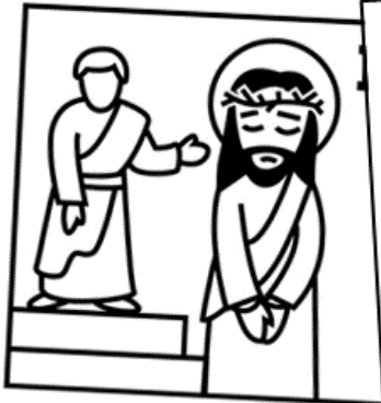
JUDAS BETRAYS JESUS

14 Then one of the Twelve—the one called Judas Iscariot—went to the chief priests 15 and asked, "What are you willing to give me if I deliver him over to you?" So they counted out for him thirty pieces of silver. - Matthew 26:14-16