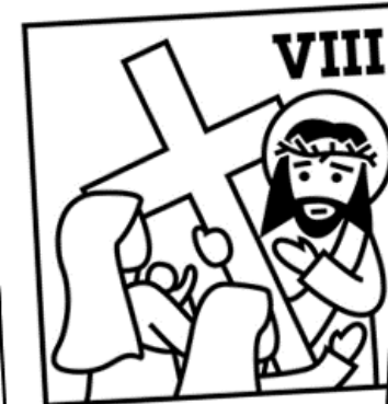
JESUS MEETS THE WOMEN OF JERUSALEM

27 A large number of people followed him, including women who mourned and wept for him. Jesus turned and said to them, "Daughters of Jerusalem, do not weep for me; weep for yourselves and for your children."