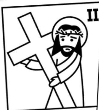
JESUS ACCEPTS HIS CROSS

14 Then one of the Twelve—the one called Judas Iscariot—went to the chief priests 15 and asked, "What are you willing to give me if I deliver him over to you?" So they counted out for him thirty pieces of silver. - Matthew 26:14-16