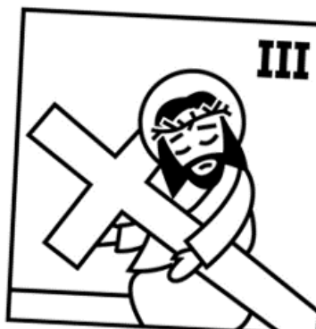
JESUS FALLS FOR THE FIRST TIME

27 Then the governor's soldiers took Jesus to the Praetorium and gathered the whole company around him. 28 They stripped him and put a scarlet robe on him, 29 and then twisted together a crown of thorns and put it on his head. They put a staff in his right hand. They bowed down to him and mocked him. "Hail, King of the Jews!" - Matthew 27:27-29 (NIV)