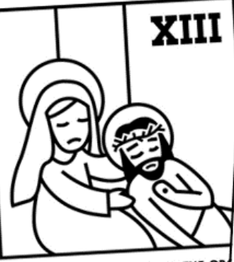
JESUS IS TAKEN DOWN FROM THE CROSS

and they crucified him. Dividing up his clothes, they cast lots to see what each would get.