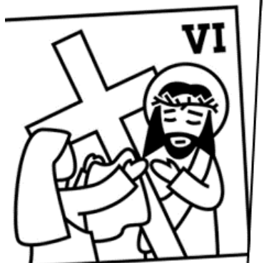
VERONICA WIPES THE FACE OF JESUS

24 When Jesus saw his mother there, and the disciple whom he loved standing nearby, he said to her, "Woman, here is your son," 27 and to the disciple, "Here is your mother." From that time on, the disciple took her into his home. - John 19:26-27 (NIV)