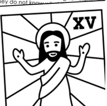
JESUS IS RESURRECTED

59 When Joseph had taken the body, he wrapped it in a clean linen cloth, 60 and laid it in his new tomb which he had hewn out of the rock.