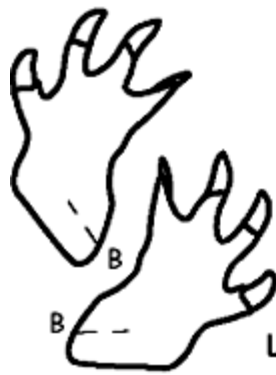
Legs & Feet