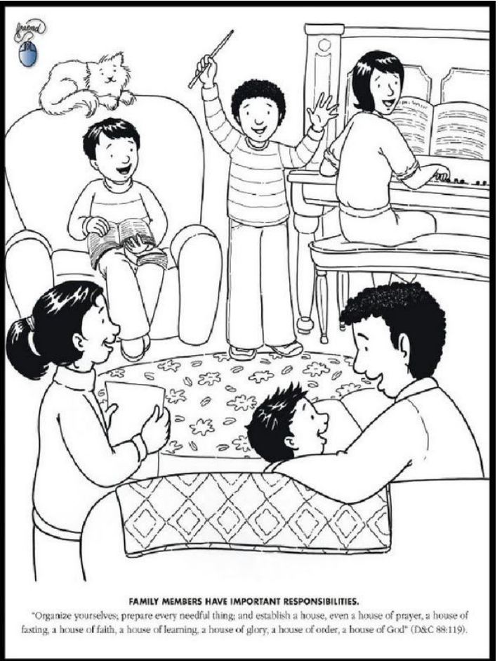
FAMILY MEMBERS HAVE IMPORTANT RESPONSIBILITIES. "Organize yourselves; prepare every needful thing; and establish a house, even a house of prayer, a house of fasting, a house of faith, a house of learning, a house of glory, a house of order, a house of God" (D&C 88:119).