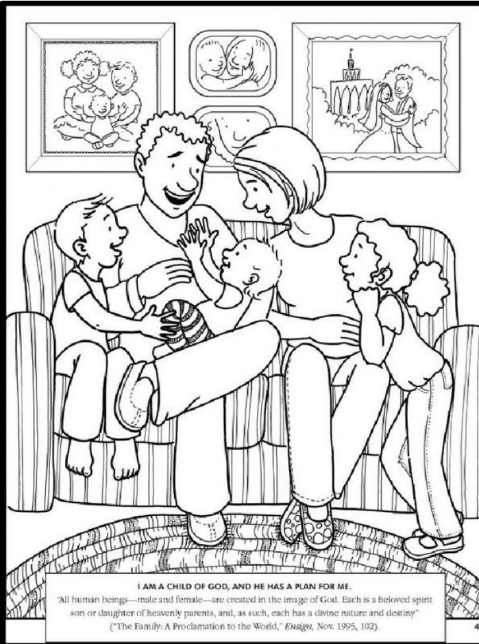
I AM A CHILD OF GOD, AND HE HAS A PLAN FOR ME. "All human beings—male and female—are created in the image of God. Each is a beloved spirit son or daughter of heavenly parents, and, as such, each has a divine nature and destiny" ("The Family: A Proclamation to the World," Ensign , Nov. 1995, 102).