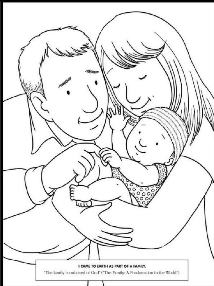
I CAME TO EARTH AS PART OF A FAMILY. "The family is ordained of God" ("The Family: A Proclamation to the World").