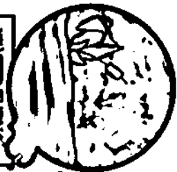
WATER TURNS TO BLOOD